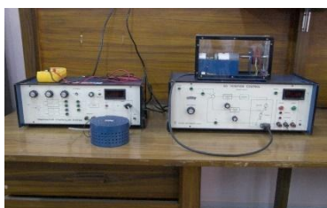
DC Motor speed & position control system