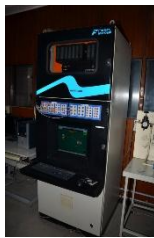
Process Control using DCS