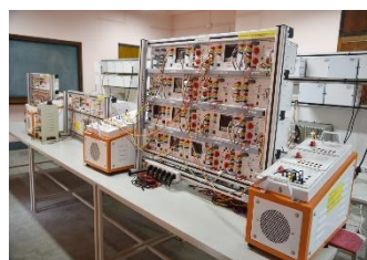
Experimental setup on Power System Laboratory