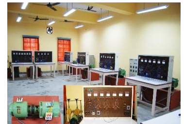
Experimental setup on Electrical Machine