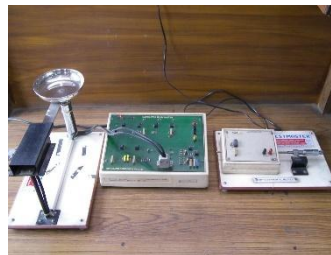
Load Cell in Measurement & Transducer Laboratory