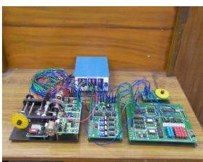
Microprocessor based control system