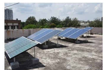
Solar Panel for Non-Conventional Energy sources

Faculty members of the department are actively engaged in research in different areas of interest. In this process, they have already published about more than 100 research papers in different National and International Journals and Conferences and represented the Institute in various International Conferences in different countries.