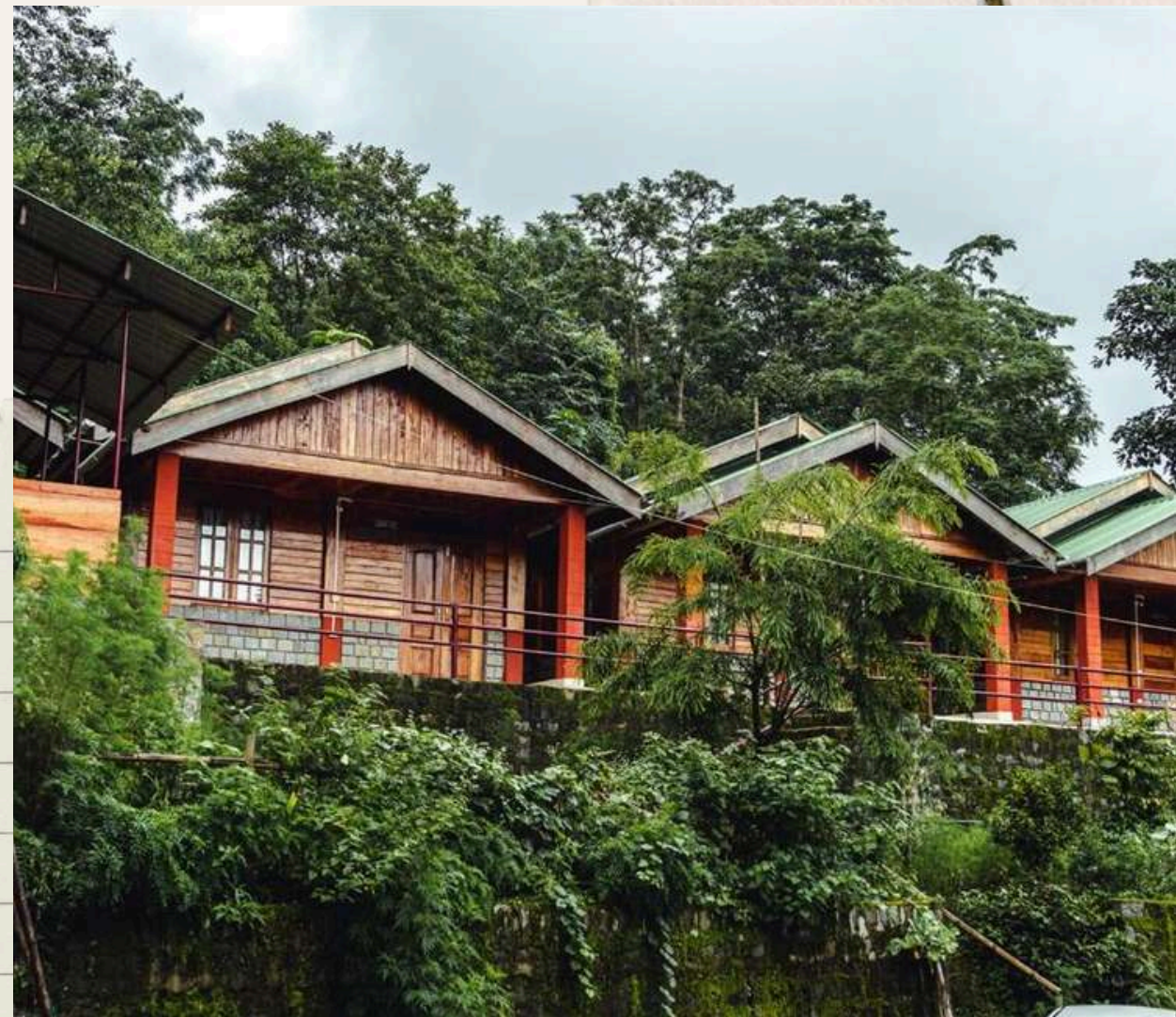
CAMP DAVID, KIGWEMA