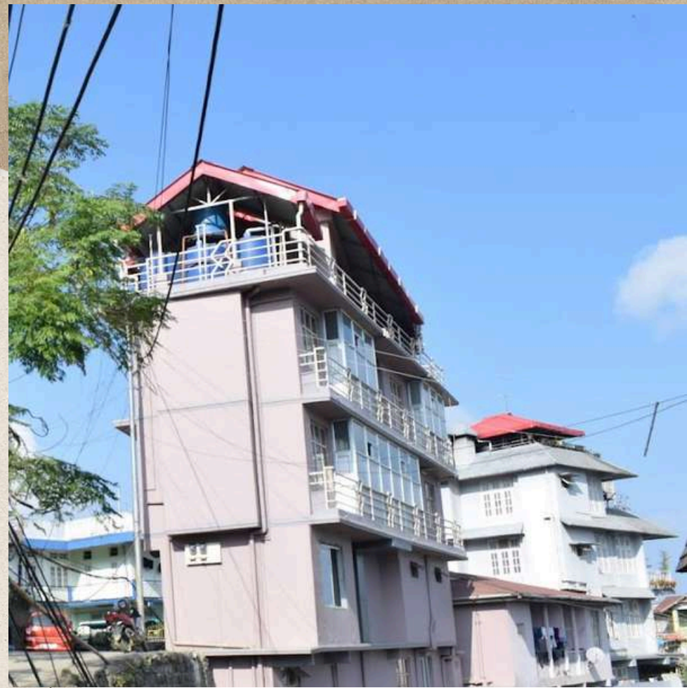
THE PALM GUEST HOUSE