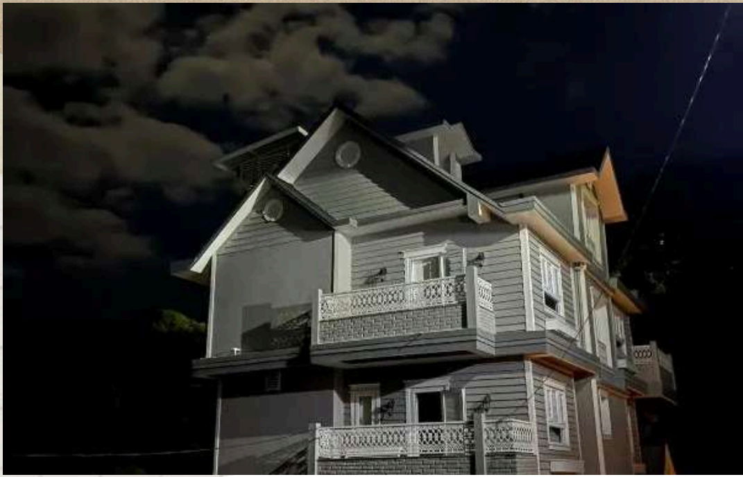
THE PITCH ROOF